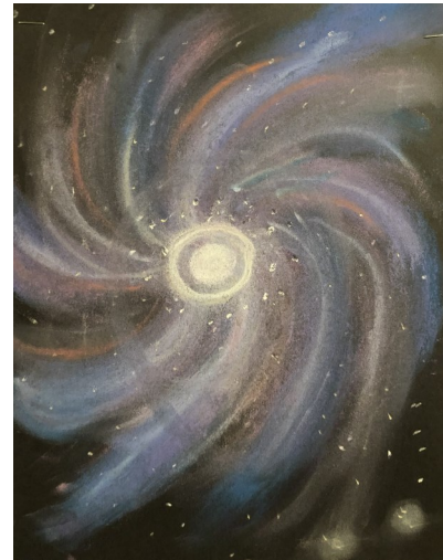
Gr. 6 Spiral Galaxies