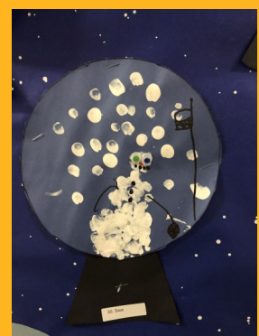
Gr. 1 Snow Globes

Please download our School App on iTunes or Google Play Store